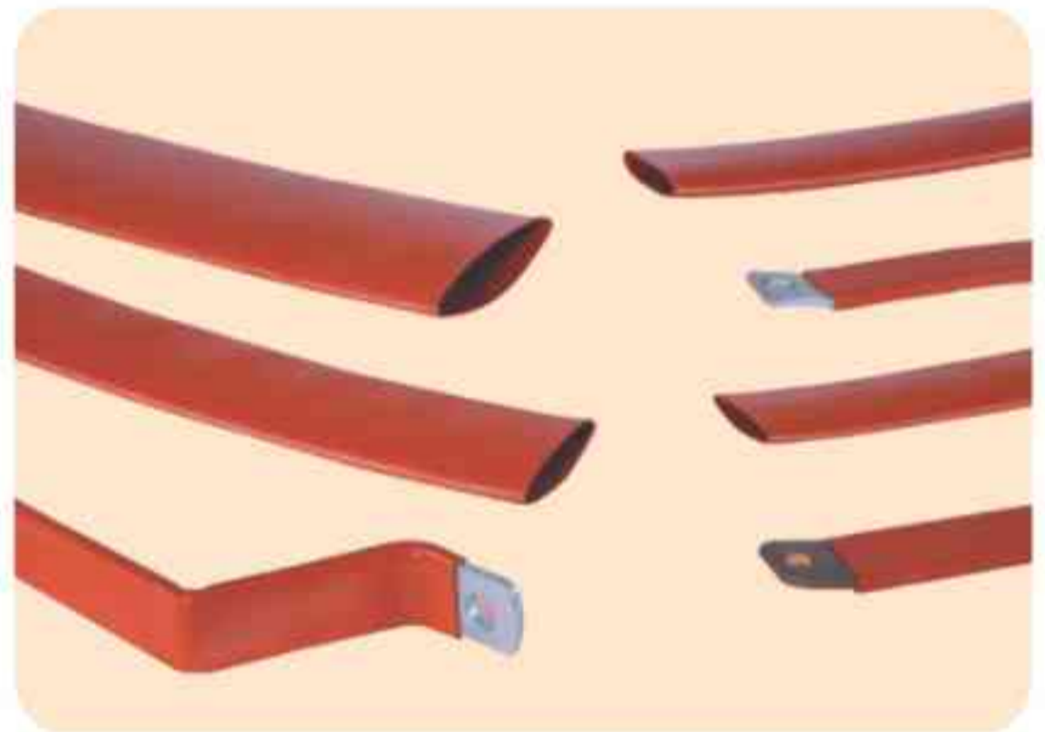
GMB / GHB Series Tube