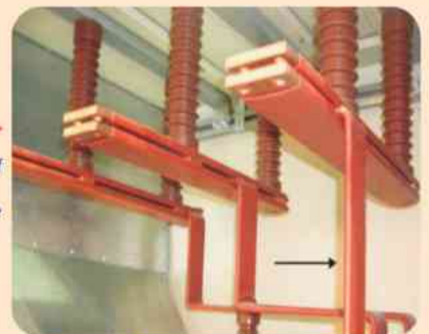
Technical Qualification Report : QR 1016

Application of Heat Shrink Busbar Sleeve