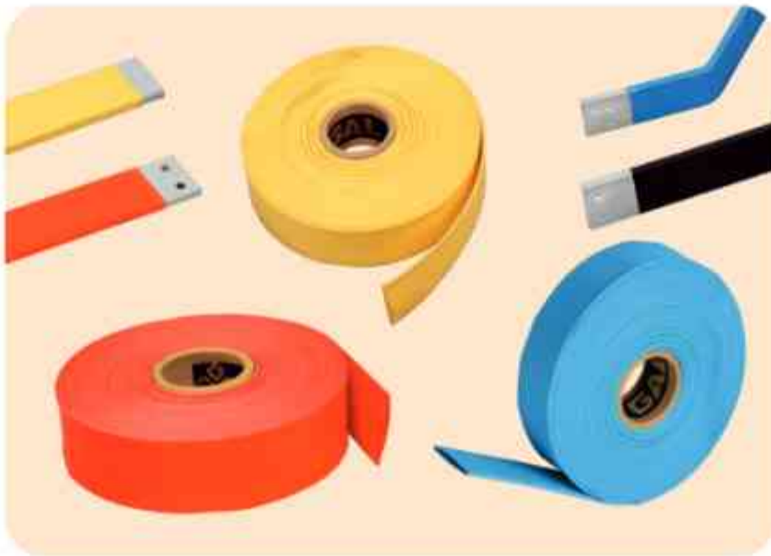
GSC Series Tube